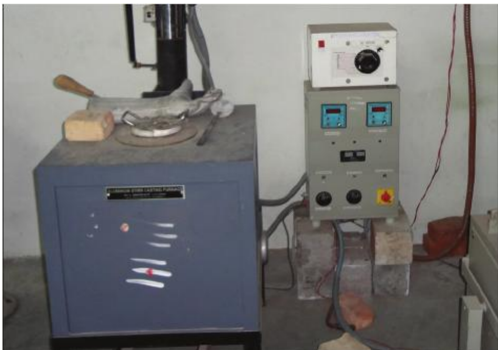
Figure 1: Stir casting furnace

First of all, Al 5083 alloy was heated to 680°C in a graphite crucible in electrical resistance furnace until the Aluminium alloy melted completely. The stirring speed and weight percentage of sic has been changed to according to the design matrix. The remaining parameters are kept as constant. The Al5083 is heated 3 hours in the furnace and then the sic particles are added to the furnace and stirring process is started slowly to reach the required speed of the stirrer blade. The stirring time kept as 15 minutes for complete mixing of al and sic particles after that the molten liquid poured into the moulds the work pieces are cooled down as per the design matrix.