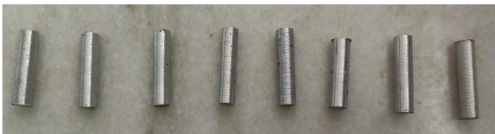
Figure 4: wear test work pieces