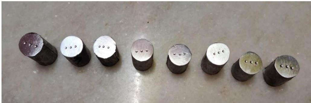
Figure 2: Work pieces after hardness test

Hardness Test Brinell hardness test was performed to measure the hardness of the specimens. A force of 250kg was applied on the specimens by indenter of diameter 5mm for 10 seconds. The depression formed was studied under the microscope and the Brinell hardness number was calculated accordingly. Three readings were taken at different positions on the specimens to get maximum accurate results. The readings are then plotted on the table 4 shows the observed readings and results. After completing the experiments according to the L_8 orthogonal array parametric combinations, hardness and wear resistance for each work piece is calculated. For the calculated values of hardness signal to noise ratios(S/N ratio) are obtained by using statistical tool MINITAB 17.